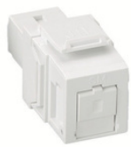
QUICKPORT SC Shuttered Adapter

QUICKPORT FiberOptic Adapters provide connectivity for workstation cabling termination on single-mode and multimode fiber cable. QUICKPORT bulkhead modules snap into any housing with the QUICKPORT name: flush-and surface-mount outlets, multimedia outlet system (with adapter), patch panels, and patch blocks.