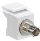
QUICKPORT ST Adapter