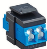
QUICKPORT LC Shuttered Adapter