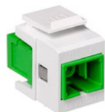
QUICKPORT SC/APC Adapter