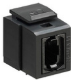
QUICKPORT MTP Adapter