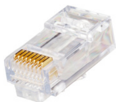
EZ-RJ45 Cat 6 Plug

The EZ-RJ45 Cat 6 Plug and Crimp Tool provides quick, cost-effective UTP wire terminations. The plug features openings that allow wires to be inserted and extended out of the front, providing increased performance, wire sequence verification, and no wasted connectors, crimps, or bad terminations. The crimp tool features a built-in cutter and stripper that crimps and cuts wires in one operation. It accommodates EZ-RJ45 plugs, and most standard RJ-45 and RJ-11 plugs. This craft-friendly tool features precision ground-crimp dies, a full-cycle ratcheting mechanism, and steel construction for strength and durability.