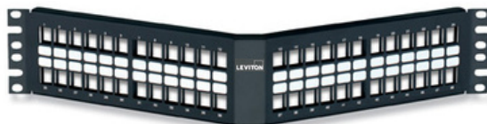
48-port panel, 2RU